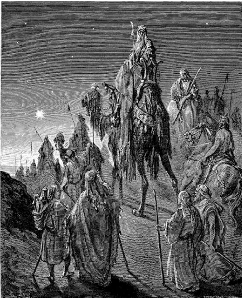
The Wise Men by Dore

Over and over again, they shouted, and their shouts echoed across the hills, “His Star! We have seen His Star!” They looked at each other in the starlight and simultaneously said to each other, “Come! Let us go to the land of Jacob and worship the One who has been born King of the Jews!”