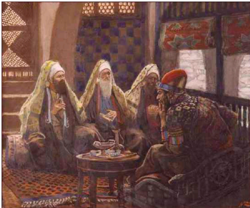
The Magi in the House of Herod by Tissot

story. Yet, Herod, the wicked Roman ruler, was so convinced of the truth of the Magi's report that he sent a company of soldiers to Bethlehem to slaughter all the children from two years old and under to remove the perceived threat to his throne.