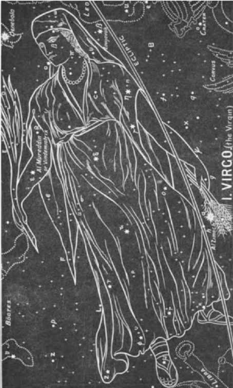
Virgo - From the Ancient Star-maps, Illustration from 1893 Edition, E.W.Bullinger, "Witness in the Stars," (London: St. Paul's Churchyard).