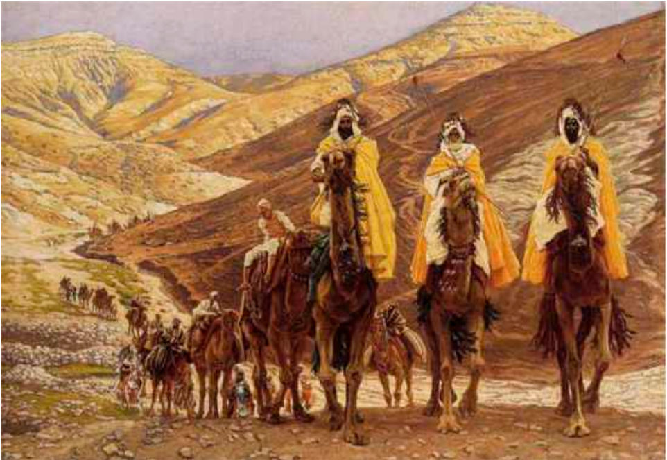
Journey of the Magi - James Tissot

Quickly they turned their camels toward the land of Jacob. By night they followed the star over endless miles of rough terrain and desert, and